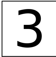
Figure 3: The number three.

Duis aute irure dolor in reprehenderit in voluptate velit esse cillum dolore eu fugiat nulla pariatur. Excepteur sint occaecat cupidatat non proident, sunt in culpa qui officia deserunt mollit anim id est laborum.