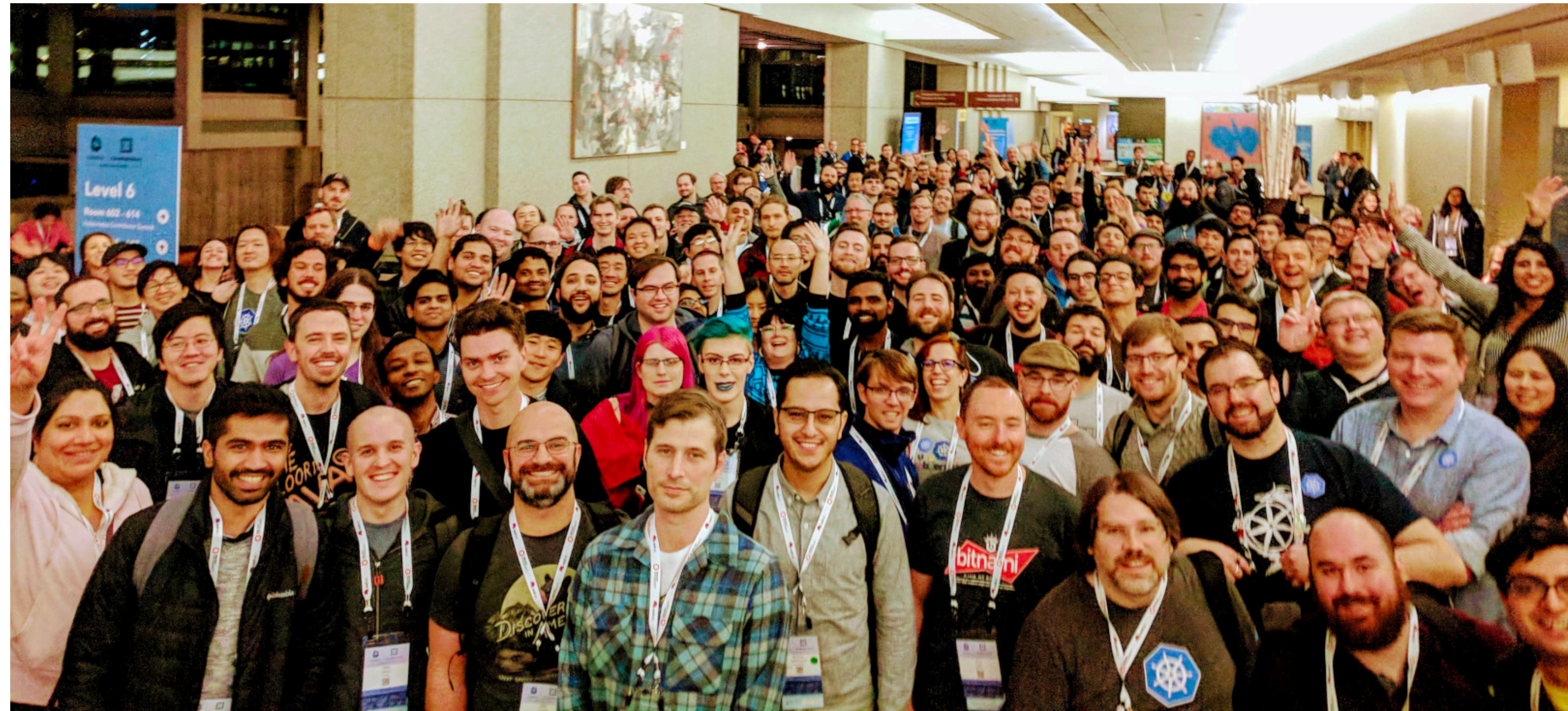
Contributor Summit Picture CC BY 4.0

* Special Interest Group / Working Group