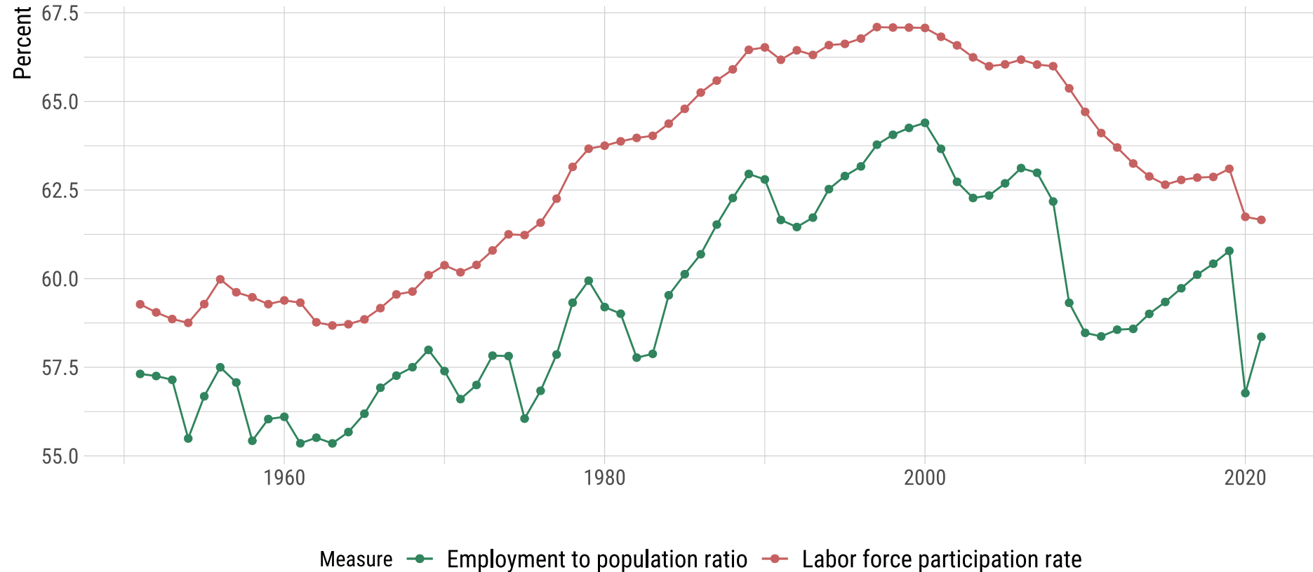
Labor market data: US, 1950–2021